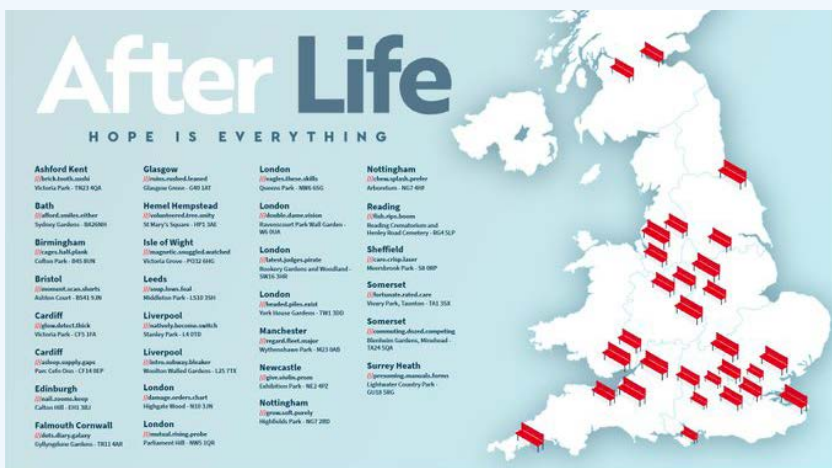
@RickyGervais | Ricky Gervais | 15.07.2022

If you get a chance this summer, try to find one of the 30 #AfterLife benches we've stuck around the country to encourage people to talk. #HopelsEverything