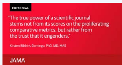
@JAMA_Current | JAMA | 5.07.2022