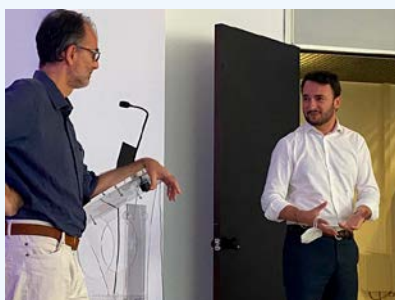
@ForwardRPM | Progetto Forward | 7.07.2022